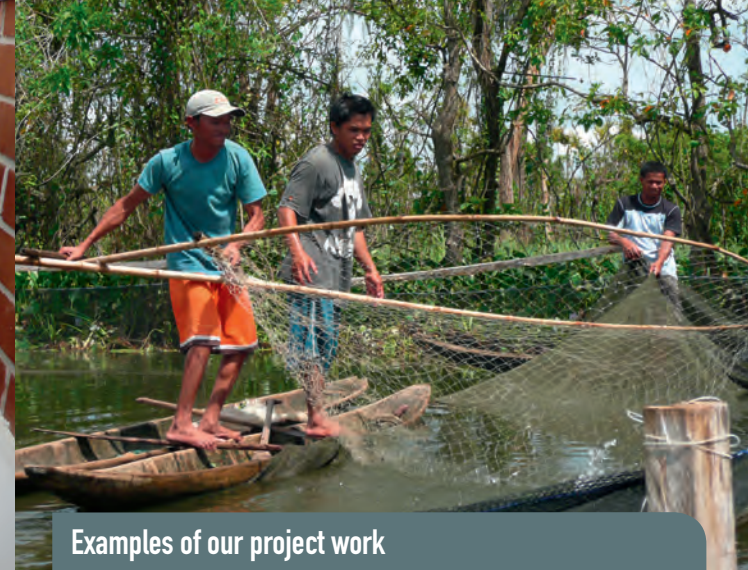
Examples of our project work